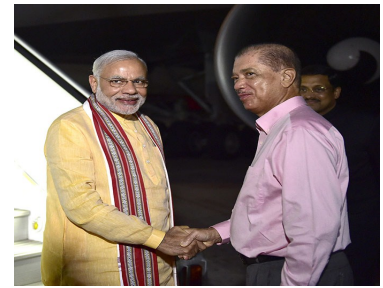
PM Modi being received by President of Seychelles, Mr. James Michel

PM Modi, the first Indian Prime Minister to visit Sri Lanka in 28 years, held summit level talks with Sri Lankan President Maithripala Sirisena, who was in India last month on his first foreign trip after assuming office in January. PM Modi also held talks with his Sri Lankan counterpart Ranil Wickramasinghe. The visit by PM was aimed at further strengthening all aspects of the bilateral relationship. PM Modi addressed the Sri Lankan Parliament during the visit. He became the first Indian Prime Minister and only the second foreign leader after British Premier David Cameron to visit Jaffna, the war-ravaged Northern province, where he handed over homes built with the help of Indian assistance to local beneficiaries.