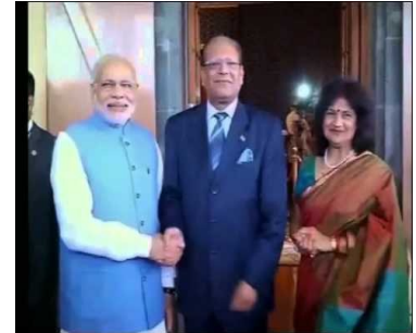
PM Modi meets the President of Mauritius, Mr. Rajkeswur Purryag