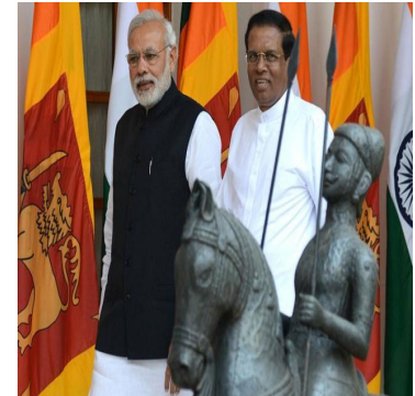
PM Modi with Sri Lankan President Maithripala Sirisena